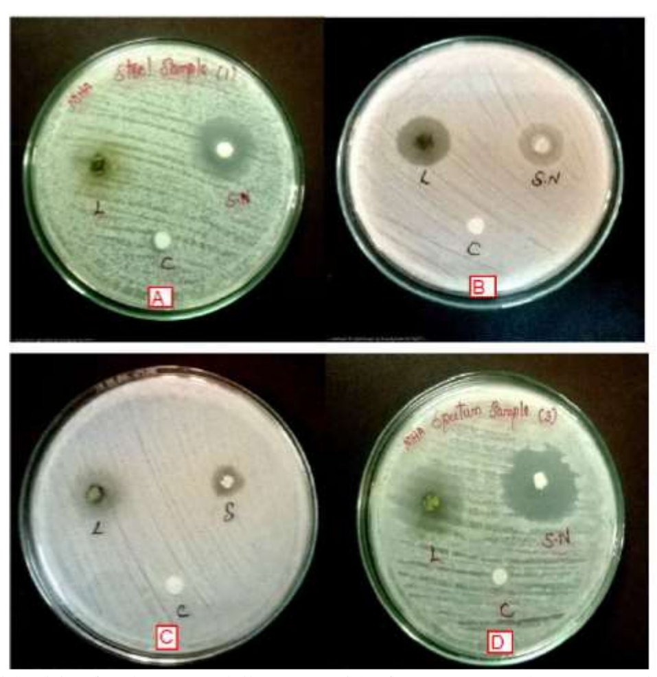
Fig. 2: Antibacterial activity of crude extract and silver nanoparticle of Argyreia cymosa leaves. A. E. coli; B. S. aureus; C. P. aeruginosa; D. Bacillus sp.